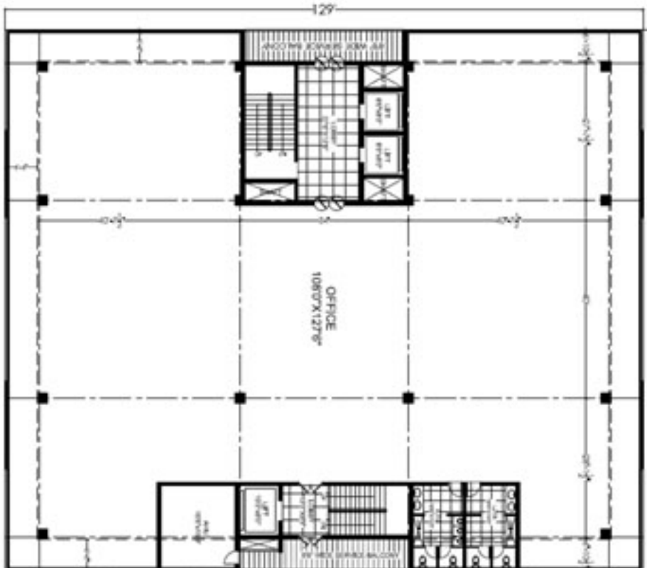
FIRST TO FOURTH FLOOR PLAN (FIRST LVL.)